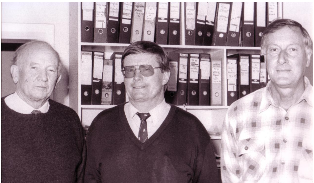
Morgan, Howey, Fraser and Partners This later emerged as Scone Veterinary Hospital.